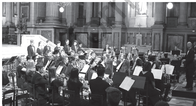
The Foothill High School Wind Symphony performing the world premiere of "Flight of Falcons" at L'Eglise De La Madeleine, Paris, France - June 4, 2019.

The two tambourines should be of different sizes, Tambourine 1 being the smaller of the two. The preferred hand drum is a doumbek, but a darbuka or small djembe drum can also be used. The drum should project robustly.